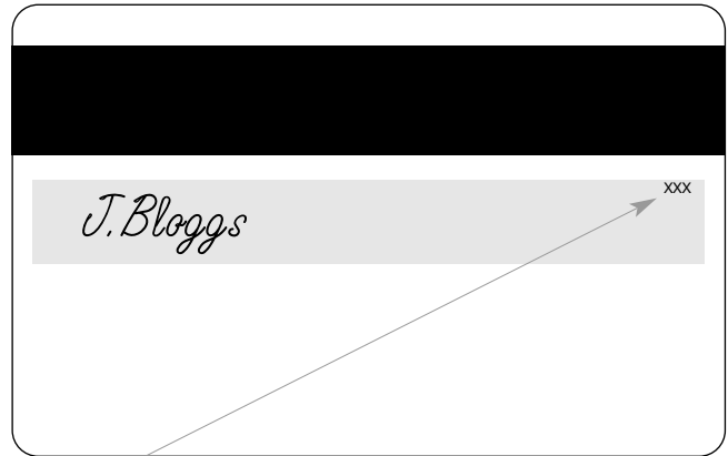
The security code